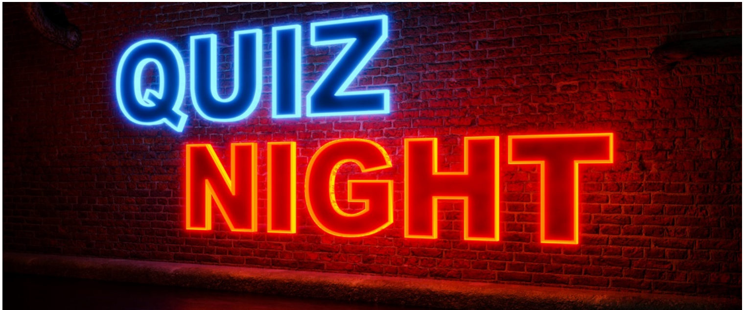
TABLE QUIZ & RAFFLE

The PTA will host a table quiz in the Foxhunter on the evening of Friday 26th April for all the parents and teachers to enjoy.